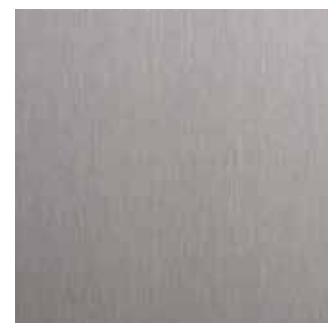
Aluminium with stainless steel effect (E2/ES)